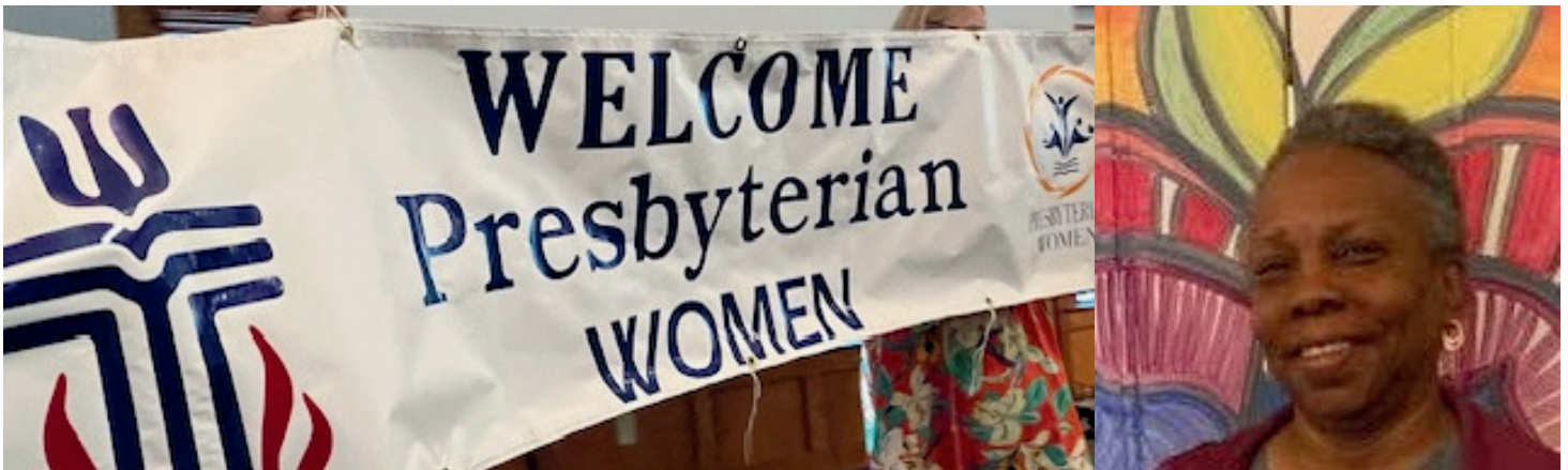
MODERATOR, MONICA GREEN